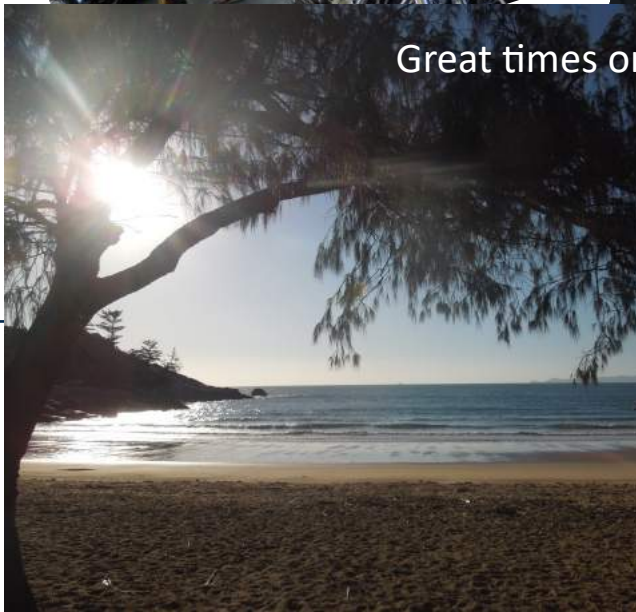
Great times on Magnetic Island