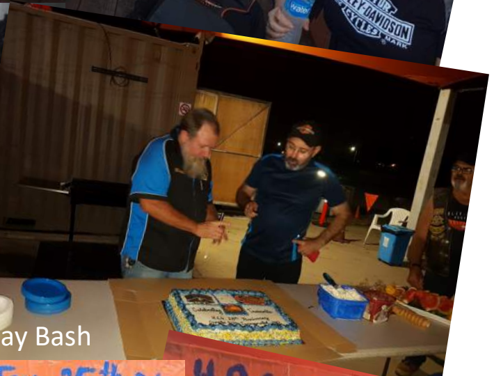
25th Birthday Bash